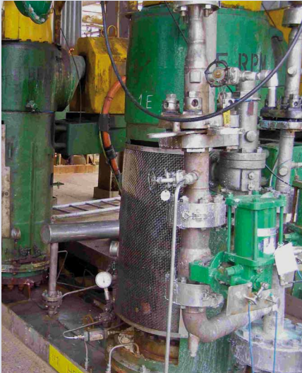
Autoclaves at Kwinana Nickel Refinery

A steady increase in production has been under way at BHP-Billiton – Kwinana Nickel Refinery (KNR) south of Fremantle in Western Australia. In 1991, the company's board agreed to pour $ 50 million into the facility as part of an overhaul of the WA nickel division.